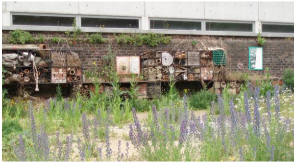
Living Wall occupied by wren, blackbird, weasel and vipers bugloss in crushed CDs

Our visit started with the obligatory coffee and biscuits and then Grant took us around the centre highlighting different habitats. Plants thrived on the most unlikely substrates - cockle shells, old fabric from Oxfam and crushed CDs - are just some of the more unusual.