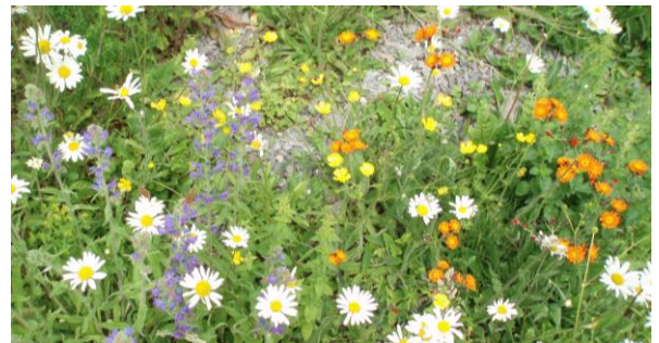
Flowers in limestone bank

Court Hey Park used to belong to the Gladstone family but over the years, much of the estate became derelict. Landlife and the National Wildflower Centre have reversed that decline and now the future is blossoming!