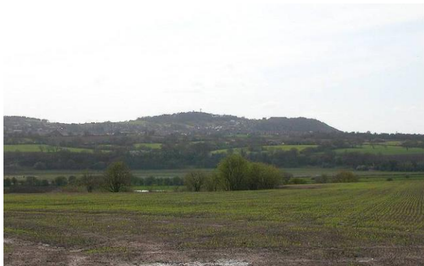
The prospect of Frodsham Hill from Aston Hall garden – valued by Repton