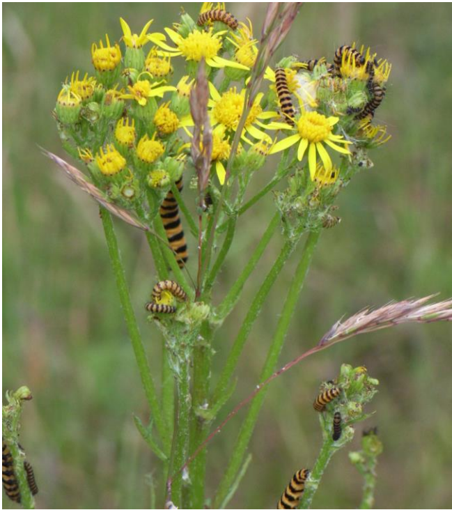
8 July 2006 – caterpillars aplenty