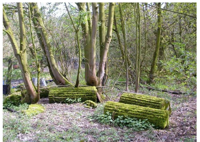
Fluted columns on the site of Aston Hall – which was demolished 1938

Site of Aston Hall – after falling into disrepair the Hall was razed to ground level in 1938. Building materials were sold or reused – some brick rubble had been used to repair the drive and the cellars were taken over by wildlife. Moss covered stone columns lie on the ground providing evidence of the Hall's portico or colonnade.