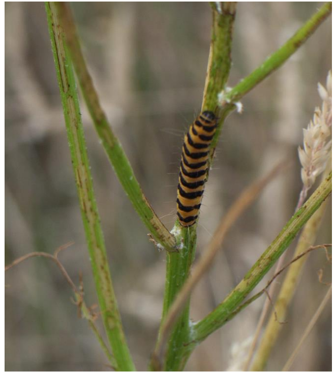
23 July 2006 – the plant has been stripped bare