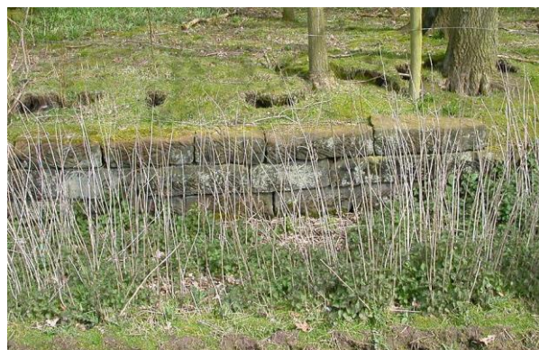
The upper 3 courses of Repton's haha wall, fronted by its infilling ditch

The top dam at Dingley Dell – was accessed through woodland carpeted with ramsons and bluebells (ancient woodland indicators). In 1802 Repton suggested modifications to the dam wall to create a waterfall at its north end and a Garden Room at its south end offering views down the Dell. Howard believed this room had been constructed, though the landscape evidence seemed inconclusive.