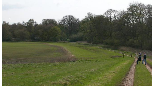
Repton's sweeping Drive to Aston Hall (sited in the wood, mid-photograph)

Chester Gate Drive – Repton's sweeping drive to Aston Hall for the use of guests and family, which, with careful tree planting, allowed a first impressive view of the Hall from close quarters and at a similar elevation